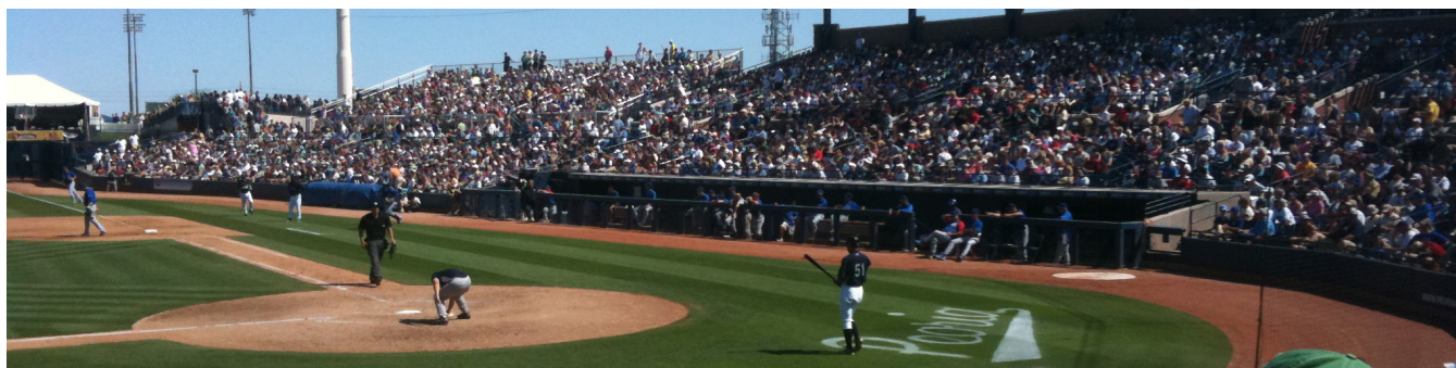
Figure 1. This is a teaser