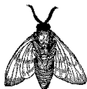
Figure 3: A sample black and white graphic that has been resized with the includegraphics command.

this wide table will “float” to a location deemed more desirable. Immediately following this sentence is the point at which Table 2 is included in the input file; again, it is instructive to compare the placement of the table here with the table in the printed output of this document.